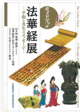
Guide book: Hokekyoten--Heiwa to Kyosei no Messeiji (Guide book: "The Lotus Sutra--A Message of Peace and Harmonious Coexistence" Exhibition)

The first volume was published in December 1985. This bulletin summarizes annual research and projects carried out by IOP researchers.