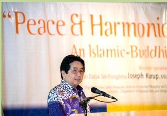
Y.B. Tan Sri Datuk Seri Panglima Joseph Kurup