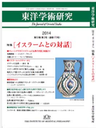
Toyo Gakujutsu Kenkyu vol. 53, No.2 (Published biannually)

The IOP publishes Toyo Gakujutsu Kenkyu (The Journal of Oriental Studies) as a scholarly publication, along with many other publications, to disseminate the results of its research and to increase its contributions to society.