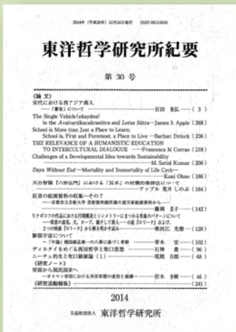
Toyo Tetsugaku Kenkyujo Kiyo (Bulletin of the Institute of Oriental Philosophy) vol.30 (Not available for purchase)

The first volume was published in July 1987. This is the English language edition of Toyo Gakujutsu Kenkyu , from which selected articles are published in English.